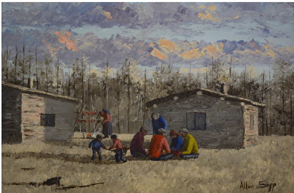
"Sun Going Down at Red Pheasant Reserve" – Allen Sapp

#1 Railway Ave East | 306-445-1760 www.allensapp.com