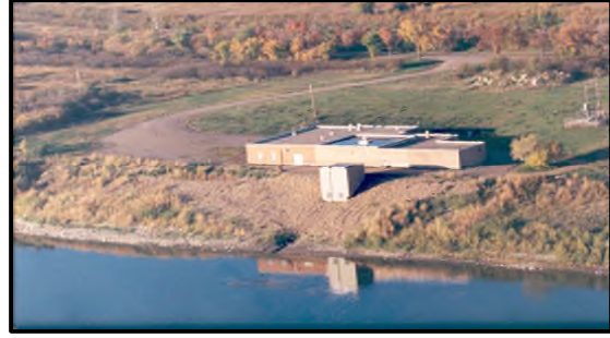
Figure 2. F.E. Holliday Water Treatment Plant

FEH WTP (Figure 2) is designated as a Class 3 Water Treatment Facility. The plant treats surface water directly from the North Saskatchewan River. Water is drawn from the river, sand is removed, and the water is treated for inorganic and organic constituents. Chlorine gas is used as the primary disinfectant with ultraviolet energy (UV) providing additional disinfection. The production capability of this plant is affected by the turbidity of the North Saskatchewan River.