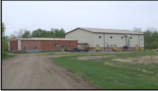
Figure 1. Water Treatment Plant #1